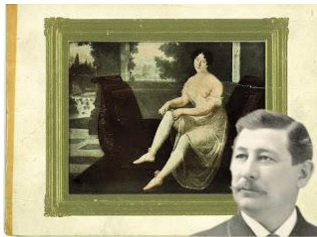
Cover of lost St. Nicholas brochure with photo of text author George Alfred Townsend

--" The Picture of Pauline Bonaparte ", lost St. Nicholas Hotel brochure, signed GATH for famed Civil War correspondent George Alfred Townsend, The Schulte Printing Works, Cincinnati